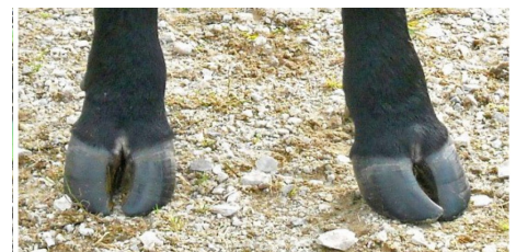
Figure 2. Female exhibiting clinical signs of corkscrew claw