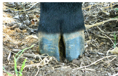
Figure 1. Example of proper hoof structure

No matter the ailment, Larson said, “Oftentimes one hoof problem can lead to other problems with the feet and legs, so it is important to consult with your veterinarian about the best way to manage it.”